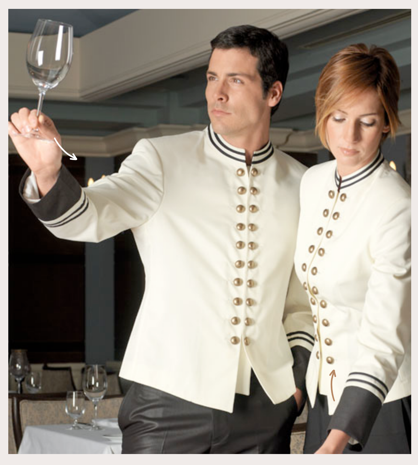
Nexova360 Textile Trading LLC.